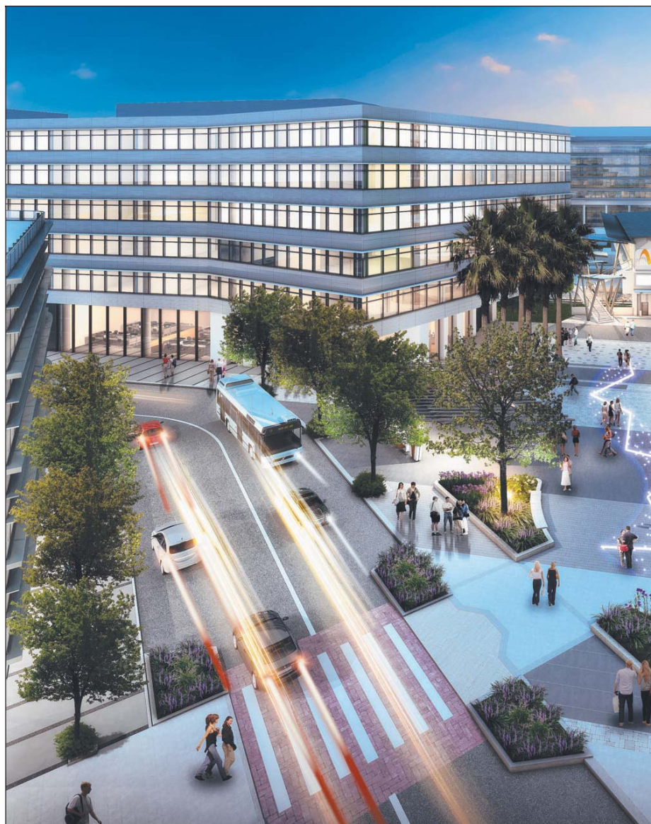
Artist's impressions of how the new development could look.