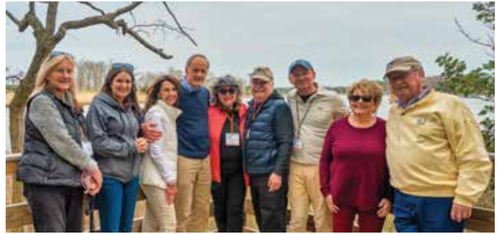
March 31 visit of Senator Tom Carper