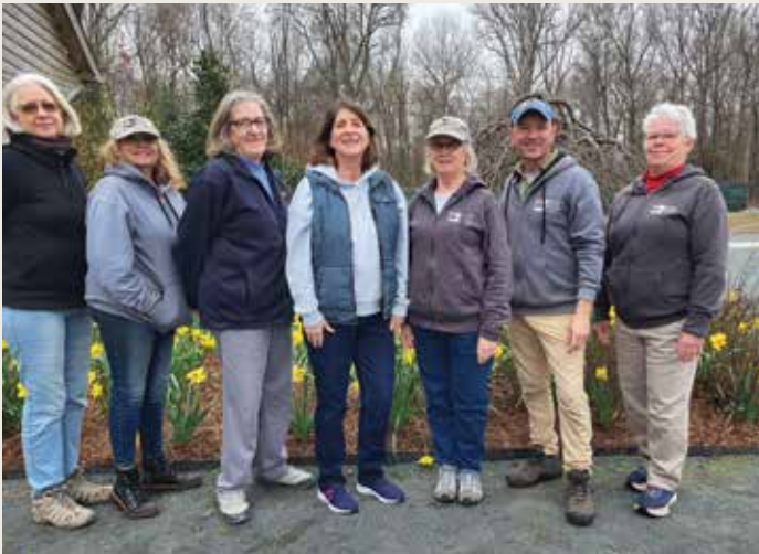
Education Committee.

A great start to the 2023 season has increased demand for classes, tours, and garden programs which have all been well received. The education team has met several times to manage program updates. DBG has already enjoyed several sold-out classes, including the following: