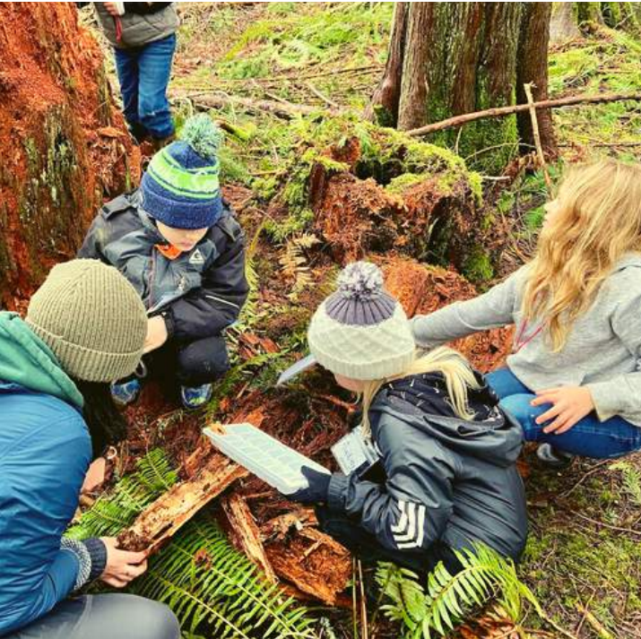
Looking for bugs in a decomposing log during an EdVentures outing with Kendall Elementary (left). Practicing outdoor teaching at a ClimeTime teacher-training workshop (right).