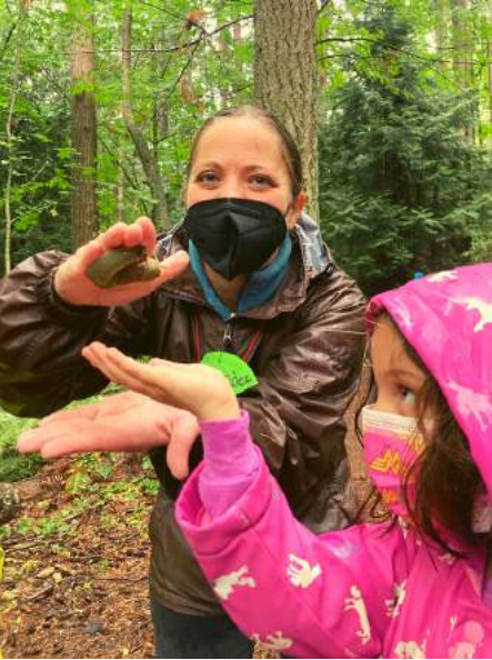
Finding slugs during our Friday morning Wild Things outings with little ones (birth-5+) and their adults (left). Playing forest games in Big Rock Garden in our after school program Neighborhood Nature (right).