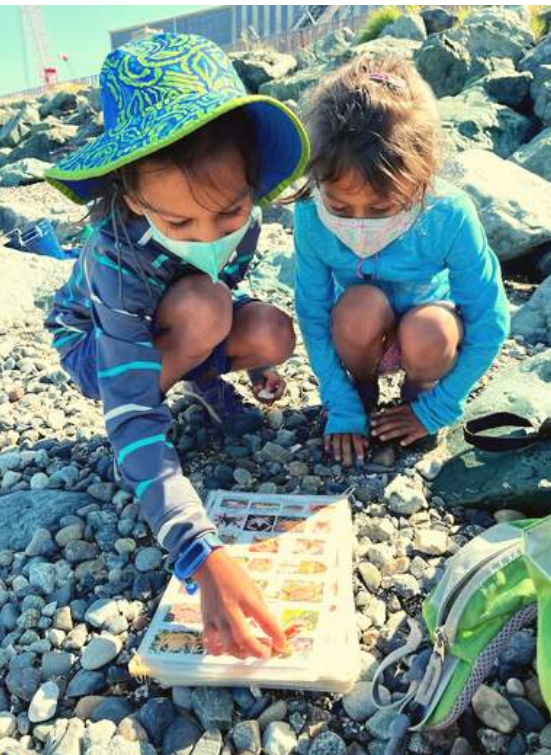
Identifying tide pool critters during our Beach Buddies camp in summer 2021 (left). Learning about local mushrooms at our Fungus Among Us Community Field Trip with the NW Mushroomers Association (right).