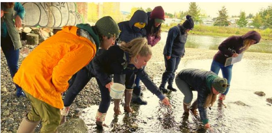
Marine Life Center staff provides a training for Wild Whatcom staff on tide pools and marine life

Our community partners and volunteers bring so much to our programs and organization! We partner with other organizations for service and stewardship outings, on themed outings such as our Low Tide Community Field Trip, and on projects such as Teaching for the Climate. This year we increased our capacity to support and work with volunteers in the field and on our Board of Directors committees. Our Explorer Mentor Apprentice (EMA) program gives Explorers Club participants the opportunity to volunteer as mentors for younger Explorers, learn leadership skills, and give back to their community!