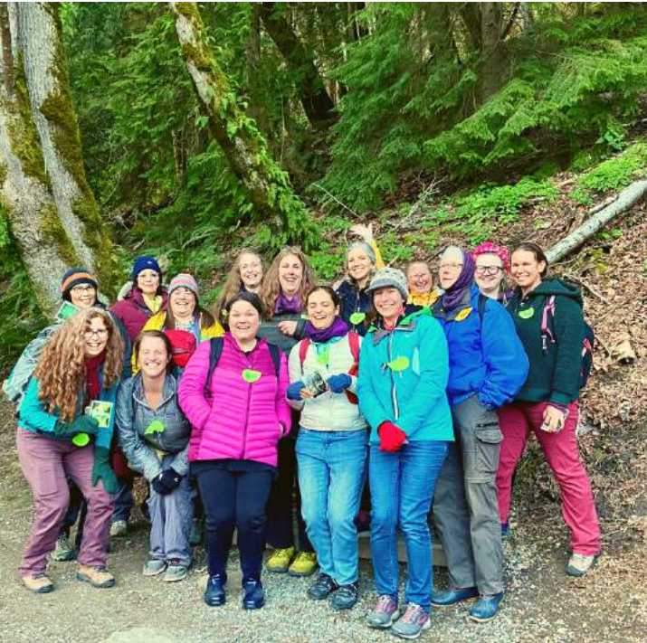
Late night exploring and community building at Squires Lake for Ladies Night Out (left). Practicing fire building in one of our Explorers Club groups at Birch Bay (right).