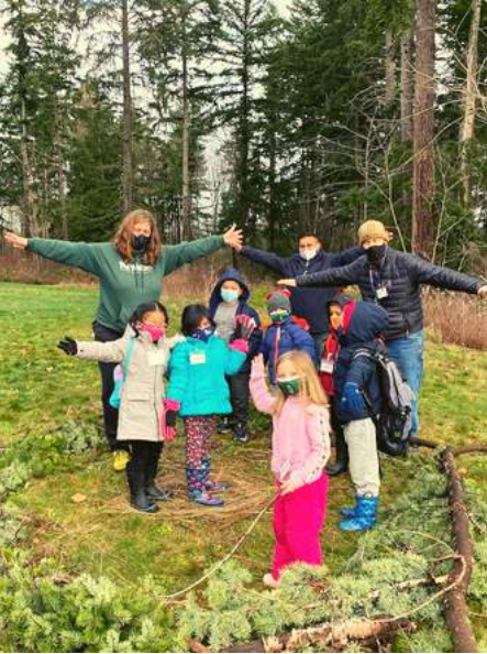
Making bird nests and practicing wingspan in our EdVentures program at Cordata Elementary (left). Learning about pollinators in our SEED program for Life Skills and BRIDGES students (right).