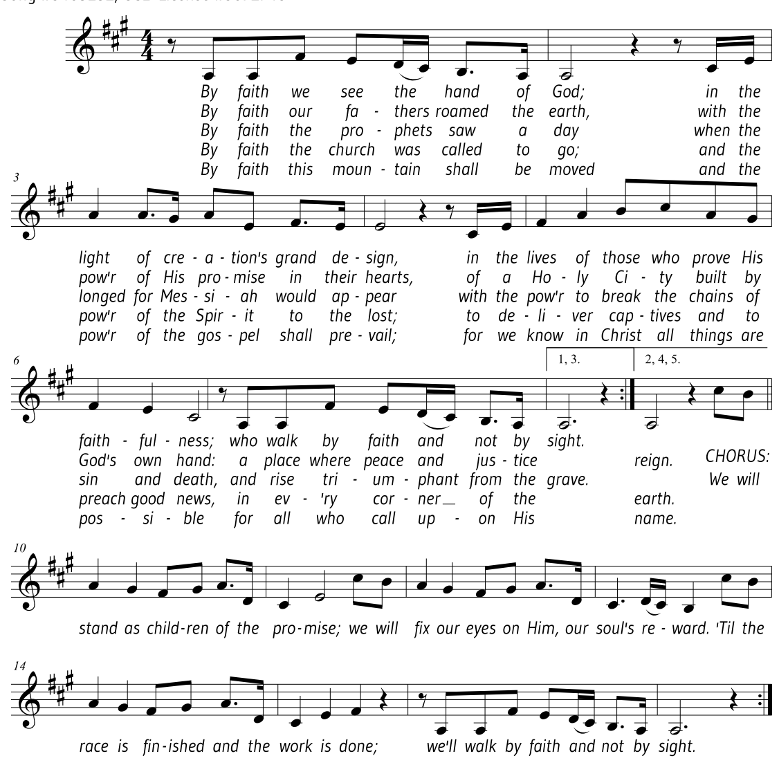
(Repeat Chorus after final verse)

Words & music by Keith & Kristyn Getty and Stuart Townend Copyright 2009, Thankyou Music, Getty Music Publishing, Capitol CMG Publishing CCLI Song #5469291, CCLI License #3071748