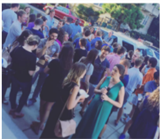
Summer Sunday at Columbia Heights in June

In May, Core Group leaders and Ministry Heads gathered at Restoration Anglican Church for Leadership Saturday, where we celebrated the ways God has been at work in our Core Groups and ministries in the last year and looked ahead to the new year. The structure of Core Groups has been modified slightly, to provide for more options and flexibility for leaders and participants. What's changed?