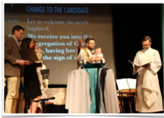
Baptism at Brookland