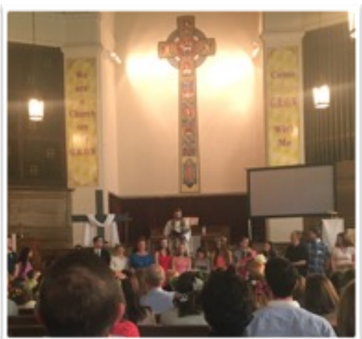
New members are received on Easter Sunday at Columbia Heights