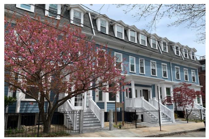
Completed Front Stairs Restoration Project

As we approach year-end 2022, we'd like to take a moment to thank you for all your support of the Cambridge Zen Center. Thanks to your generous donations, and a matching grant from the Historical Commission of Cambridge for $75,000, we have restored all three front entrances, stairways, vestibules, and gardens from 193 to 199 Auburn Street. This was a huge project that involved a lot of work and planning from the team at CZC. We hope you will be tempted to walk through these beautifully restored entryways to practice with us again in person because we are now open to the public!