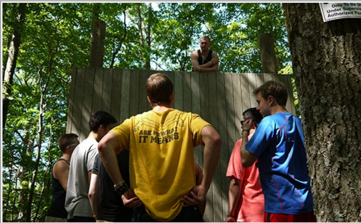
Low ropes challenge course at Bradford Woods

Phired Up on today's leading fraternity recruitment methodology, and "Stress Management for the College Man" to address the number one issue facing today's college students. Attendees left this year's event better equipped than ever to bring successful strategies back to their chapters and personal lives.