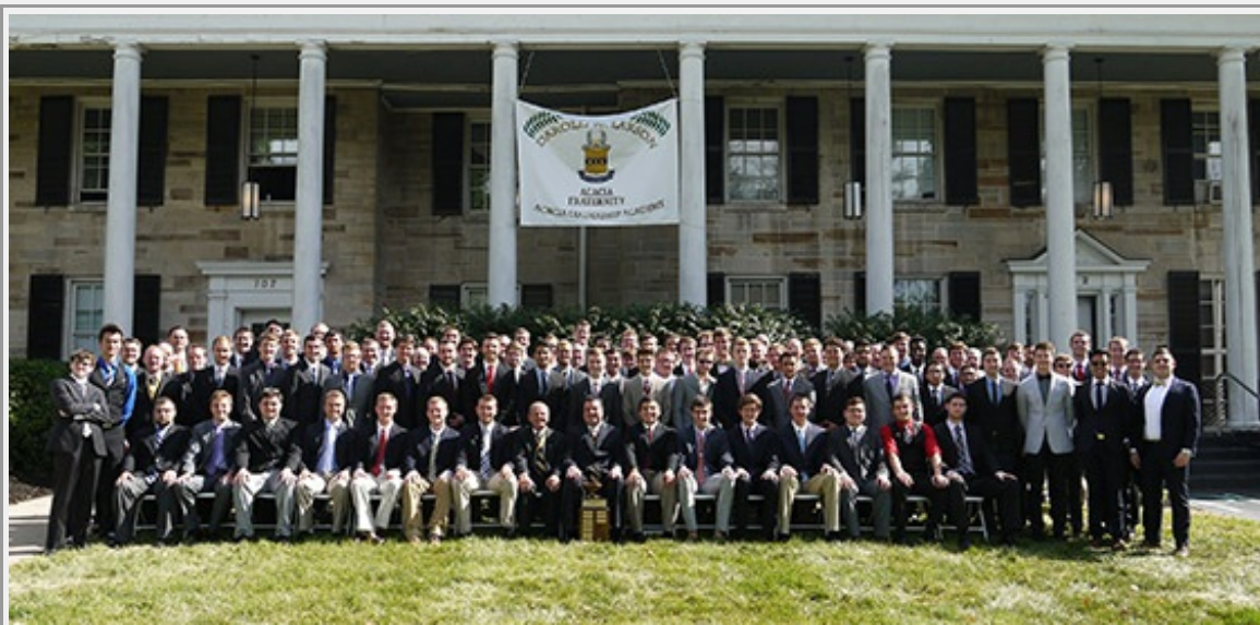
2015 Acacia Leadership Academy attendees