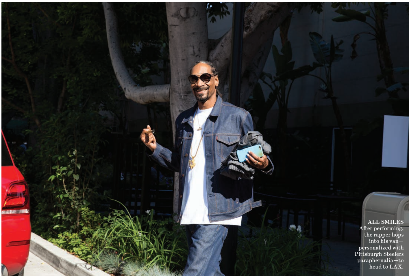
ALL SMILES After performing, the rapper hops into his van—personalized with Pittsburgh Steelers paraphernalia—to head to LAX.