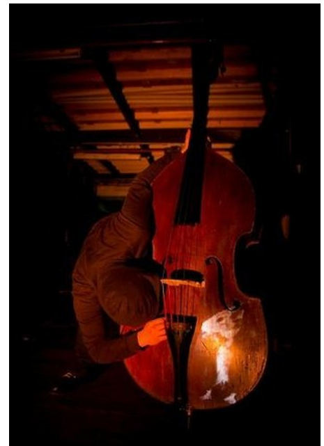
Captives of the City.

We only later learn that the vermin's trails of sonic and textual detritus are fragments of revolutionary poetry, as well as graffiti and chants taken from Egypt's Tahrir Square. Yet it's not hope that lingers but a vague paranoia of technology's ability to be hacked, co-opted, corrupted.