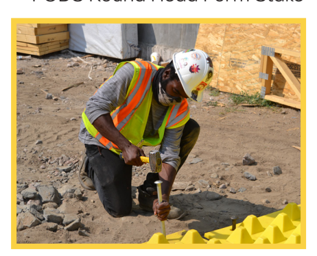
Recommended anchor for installation on soil or grade.