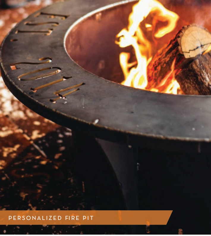
PERSONALIZED FIRE PIT