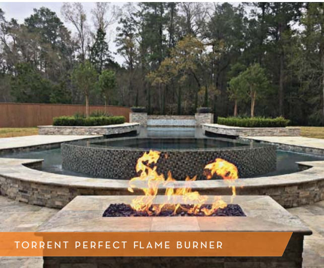
TORRENT PERFECT FLAME BURNER