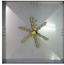
SQUARE IGNITION KITS