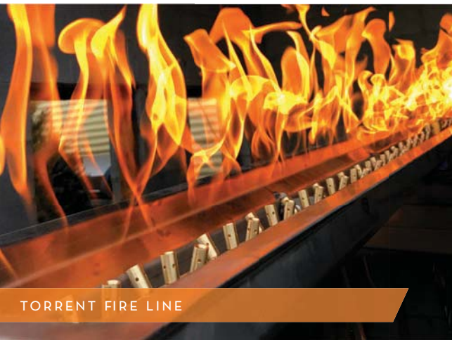
TORRENT FIRE LINE