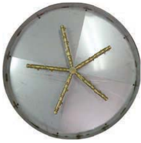
ROUND IGNITION KITS