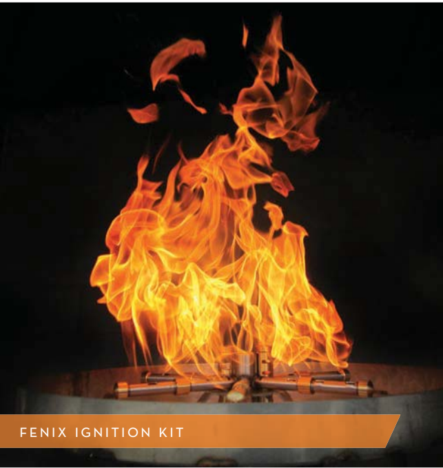
FENIX IGNITION KIT