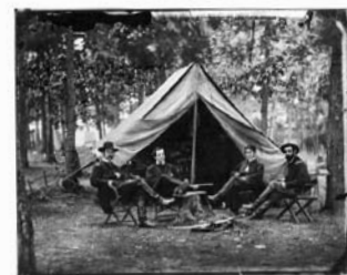
MAPPING THE AMERICAN CIVIL WAR The Alan M. and Nathalie P. Voorhees Lecture on the History of Cartography

The Confederacy's map production was hampered by lack of existing agencies and trained personnel and also by the lack of suitable printing equipment, paper, and ink. As the war progressed, an inexpensive and readily available source of maps were the major Northern newspapers. The war created an urgent need for maps that cartographers on both sides worked to satisfy. Survey methods improved, the gathering of intelligence became more sophisticated, printing techniques were improved and photo reproduction processes became an important means of duplicating maps. However, it was fourteen years after the end of the Civil War that Congress established the U.S. Geological Survey. It was many years, therefore, before modern topographic maps became available to replace those created by war's necessity. Those maps are splendid testimony to the skill and resourcefulness of Union and Confederate mapmakers.