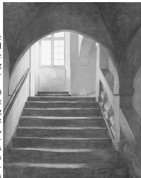
Cabors Steps, from "French Suite"

From September 10 through October 2, Art Square Gallery in Leesburg will be hosting her latest series of paintings, "French Suite." These images of historical structures in the villages and towns of southwest France display once again, her focus on the luminous light and mysterious and lingering presence of past lives, much as she has done with her esteemed series depicting slave quarters in the past. Don't miss it.