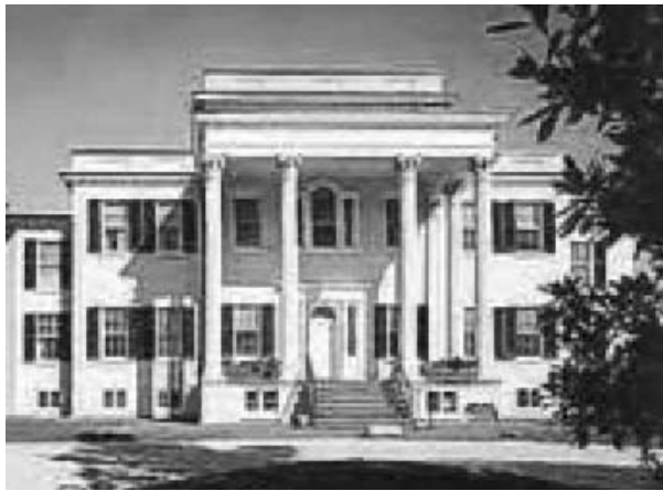
Oatlands Plantation House

Mark your calendars now, for another outstanding evening of entertainment, plus wonderful food and fellowship. On September 19, 2010 at 5:30 PM, the Friends of Thomas Balch Library, Inc. will host their annual Evening with History. This year's venue: Historic Oatlands Plantation near Leesburg. Come stroll the historic gardens, some still under restoration to their former glory at the time of the Carters and Eustis families. And learn more about the rich heritage and history of this area from a very special speaker.