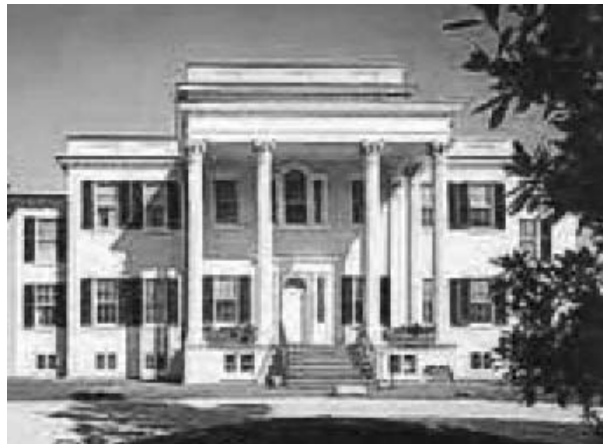
Oatlands Plantation House

Mark your calendars now, for another outstanding evening of entertainment, plus wonderful food and fellowship. On September 19, 2010 at 5:30 PM, the Friends of Thomas Balch Library, Inc. will host their annual Evening with History. This year's venue: Historic Oatlands Plantation near Leesburg. Come stroll the historic gardens, some still under restoration to their former glory at the time of the Carters and Eustis families. And learn more about the rich heritage and history of this area from a very special speaker.