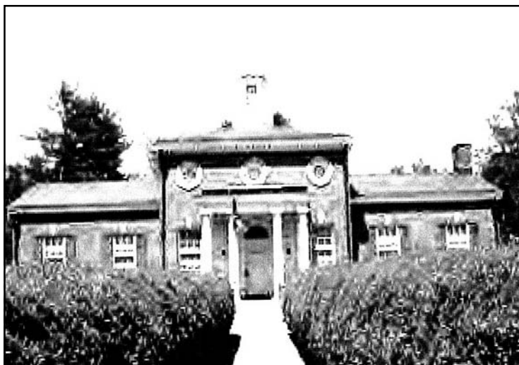
Thomas Balch Library, Front view