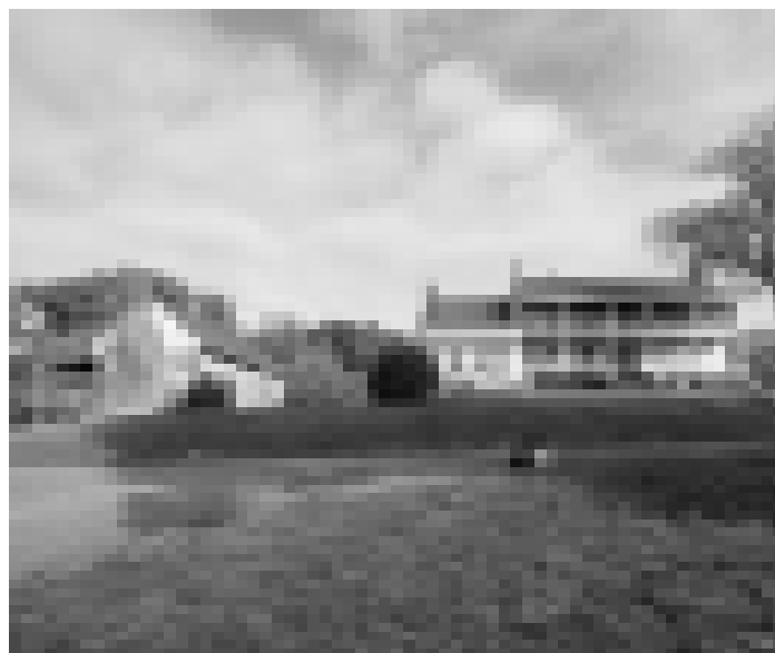
Riverside on the Potomac, near Lucketts, VA