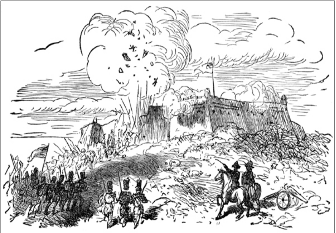
Ft. Erie Bastion explodes, but incident does not end the siege.