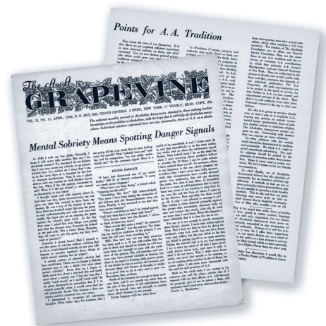
The Twelve Traditions, which came out of the problems that A.A. groups wrestled with in the first 10 years of Alcoholics Anonymous, were first published in the April 1946 issue of the Grapevine. The first page of that issue and the page on which the article about the Traditions was printed are shown here.

In a response written in May 1949 to a letter from an A.A. member in Detroit, Bill says: "Alcoholics Anonymous is in the process of evolution concerning its relations with the outside world. When you consider the vast army of screwballs that we really are, I think we have done astonishingly well." A big part of the reason that the Fellowship was healthy was that the groups learned from their mistakes, and the solutions to their problems were codified in the 12 Traditions.