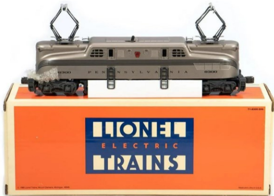
Lot 37: Lionel 6-18300 Mint Car Series Pennsylvania GG-1 Electric Locomotive in original box. Estimate $300-$500. (Photo, top left)