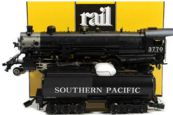
Lot 15: Sunset Models 3rd Rail "O" Scale Brass Southern Pacific F Series 2-10-2 #3770 (F-5). Mint in the original box. Estimate $500-$700. (Photo, top left)