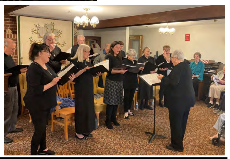
Lund Care Center on April 23

Pittsburgh Lutheran Chorus, Highpointe at Rebecca, May 7<sup>th</sup>