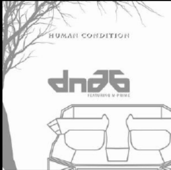
Human Condition (2007), DNA6