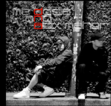
DNA (2004), DNA