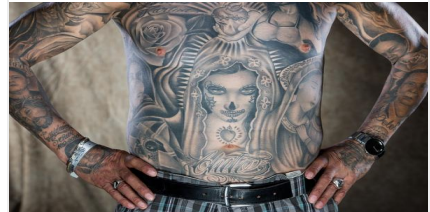
SoCal slices: Musink tattoo fest goes deeper into O.C. culture

COMMENTS | PRINT | EMAIL | SEND PDF | SHARE