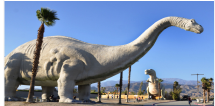
Desert detours are a trip down memory lane