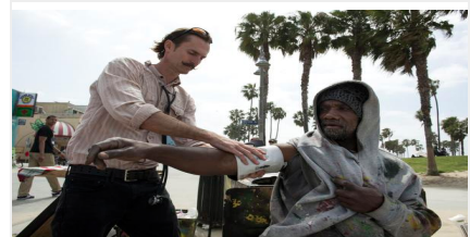
Venice doctor gets pulse of the street and the homeless