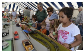
, FILE PHOTO

By LOU PONSI / STAFF WRITER Published: April 22, 2014 Updated: 1:54 p.m.