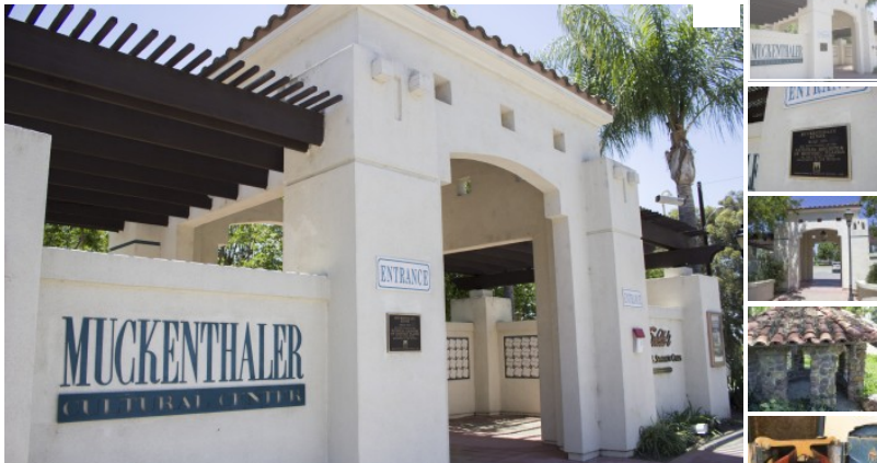
1. The Muckenthaler Cultural Center, in Fullerton, provides the community with experiences that stimulate creativity and imagination with various art galleries.