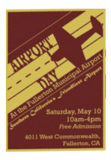
Press release for Airport Day

More information can be found at www.transportationcelebration.com