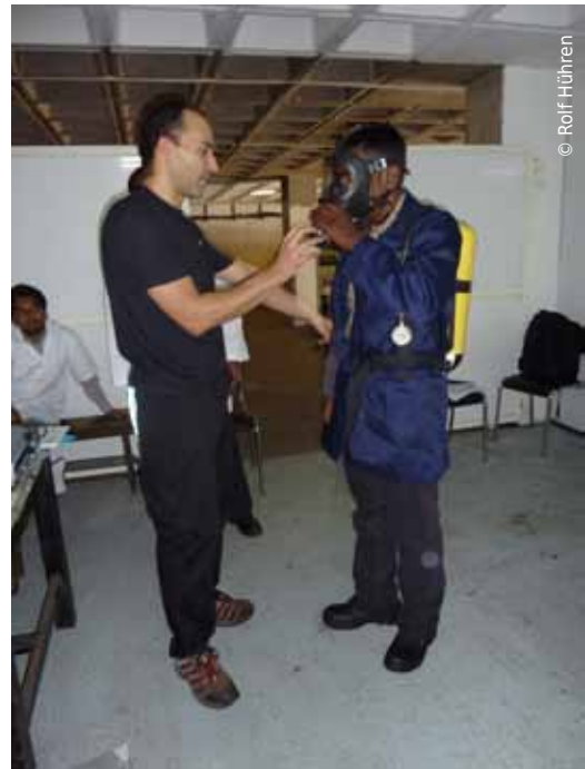
Example of respiratory equipment

Particularly with ammonia, because of its very low acute toxicity exposure limit, the permitted quantities of refrigerant (per refrigerant circuit) are extremely small. Depending upon the occupancy, location and type of system, larger quantities are allowed and furthermore, additional features can be applied to the design of the system so that the amount of refrigerant that would be released is limited. For systems installed outside or in machinery rooms, there are normally no such limitations.