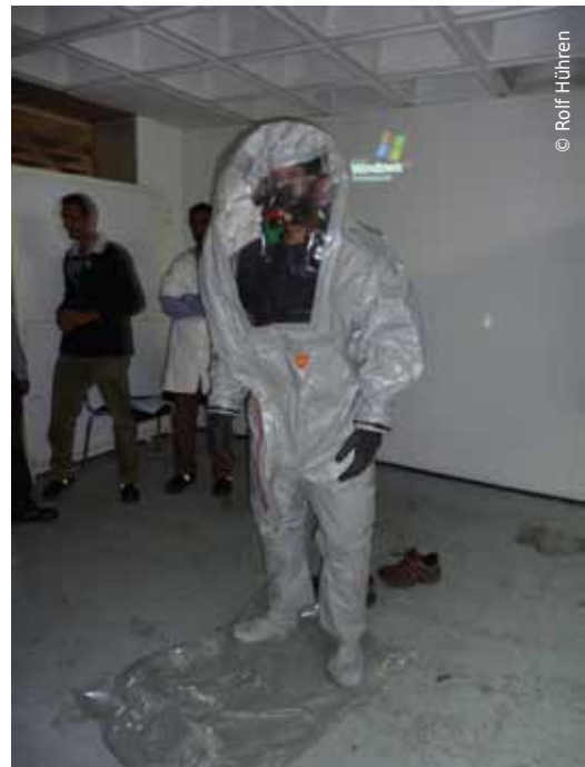
Example of protective suit for ammonia