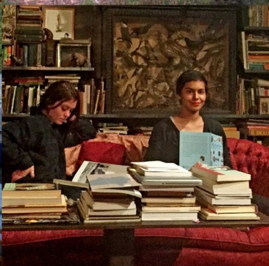
Fellows and visiting artists over the years.