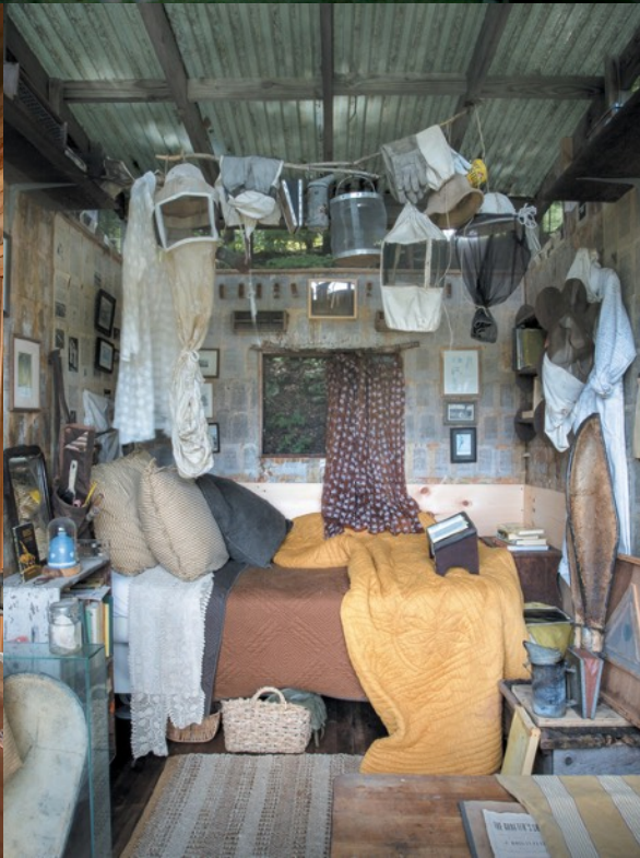
image credit: the main house; (bottom left) the Sleeping Porch; (bottom right) the Grafters Shack