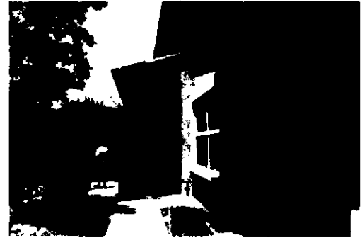
Large Yard with New Landscape