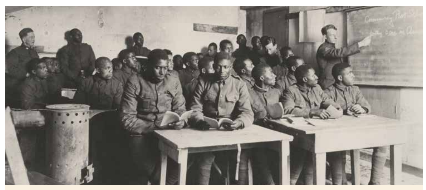
African-American soldiers attend a class in a Post School in Meuse, France.

World War I is a case in point. Its origins are buried in a legacy of militarism, imperialism, nationalism, and balance of power politics that a student could spend a lifetime investigating. At the same time, however, the start of the war provides a perfect