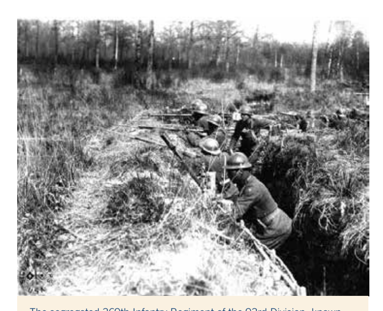
The segregated 369th Infantry Regiment of the 93rd Division, known as the "Harlem Hellfighters" or "Rattlers," was the first African-American unit to serve in the American Expeditionary Forces. General Pershing refused requests to break up American units and send them to reinforce French and British units, but this did not extend to the all-black units of the 93rd Division. The 369th, which fought with distinction, was the first American unit to reach the Rhine. Shown here are members of the 369th in the trenches near Maffrecourt, Marne, France, May 4, 1918.

Whereas a macro level examination of the war provides clarity, the micro level provides endless questions for the curious student: Why was trench warfare so brutal