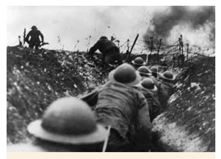
British troops going over the top of the trenches during the Battle of the Somme, 1916.

to think historically based on the evidence. In adept hands, Blackadder leads to an extremely powerful and memorable lesson on historical critical thinking and historical interpretations when its representation of the generals is contrasted with that of Professor Gary Sheffield—who, though critical of the generals, gives a much more balanced picture of their strengths and innovative thinking. A simple way of implementing this would be to concept check the idea of historical interpretations with your students. Ask them to watch the short clip and come up with a short list of the impressions it creates of General Melchett. For your next step, give out evidence cards based on Sheffield's article. Students then have to examine the evidence cards and assess which points Sheffield agrees or disagrees with in the Blackadder interpretation and why. The task of examining the evidence naturally leads onto discussing different types and purposes of historical interpretation.