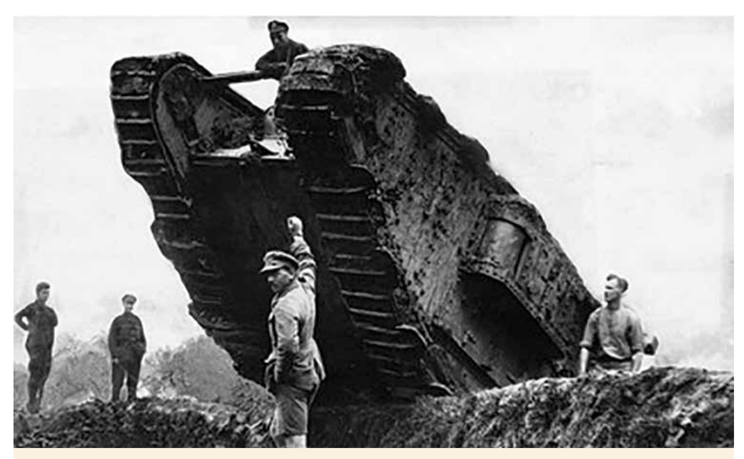
"World War I: Trench Warfare," History®, http://www.history.com/photos/world-war-i-trench-warfare (accessed Jan 1, 2014).