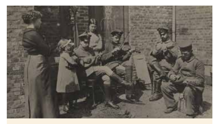
German soldiers perform on musical instruments for local children.

Editor's Note: You can find two of Matthew Elms' lessons on World War I, focusing on propaganda and women in the military during the war, at <a href="http://www.nhd.org/WWI.htm">http://www.nhd.org/WWI.htm</a>.