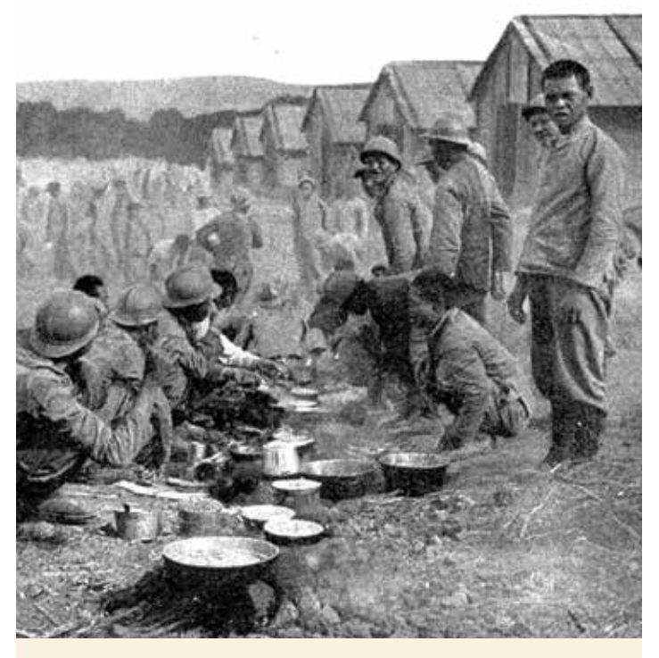
Troops from Southeast Asia serving in the French army.

On May 4, 1919, when news that Versailles negotiators had awarded Shandong to the Japanese reached them, Chinese students, workers, and merchants protested. The May Fourth Movement swept the nation. The protestors decried China's weakness as well as the hypocrisy of Western rhetoric. The May Fourth