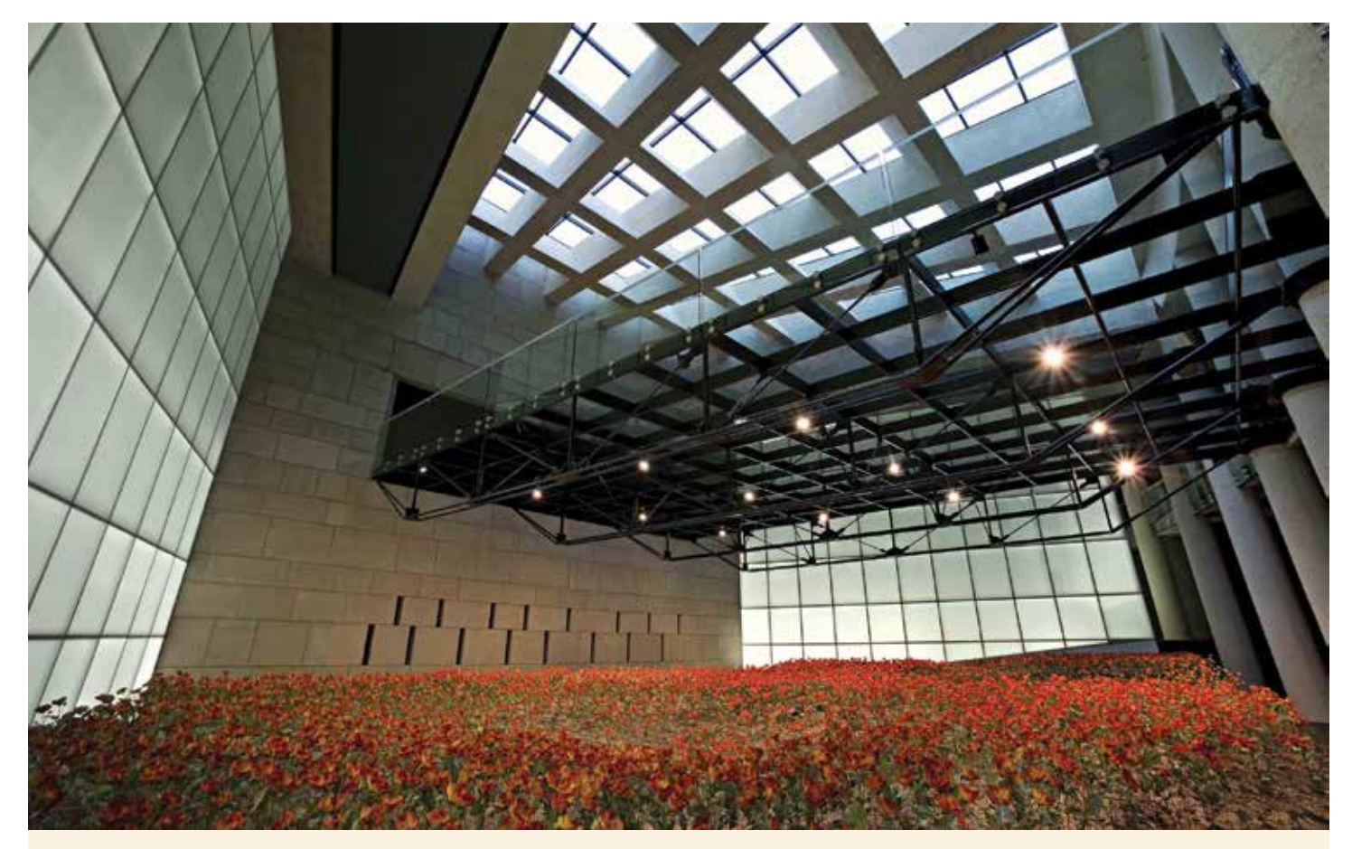
Visitors cross the Paul Sunderland Glass Bridge from the Museum lobby to the main exhibit hall, passing over a field of 9,000 red poppies, each representing 1,000 combatant fatalities from the Great War.