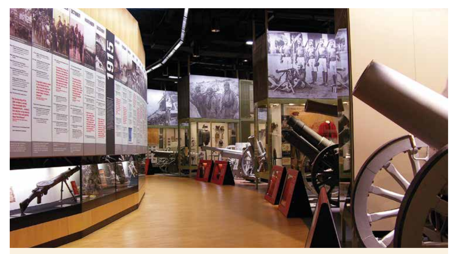
The Chronology of the War covers the 1914 origins of the conflict and its month-by-month escalation up to the 1918 armistice and the Peace Conference in Paris in 1919.

York Times bestseller lists. At the National World War I Museum, we are rolling out new information, exhibitions and resources online. Place "World War I" or "First World War" as a Google Alert to keep up with international articles being published and a wide variety of events. Look for professional development opportunities offered by National History Day, the National World War I Museum, Gilder Lehrman Institute and others. Audiobooks (Margaret MacMillan's