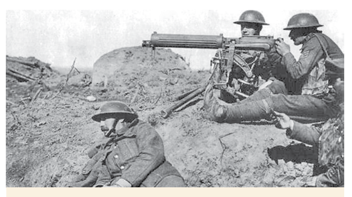
British Vickers machine-gun crew during the Battle of Menin Road Ridge, World War I.

From the history teacher's standpoint, the next four years promise an unprecedented vista of educational opportunities. This article has discussed some possibilities from a British perspective, but the important point to keep in mind is that teaching what to cover is perhaps not as important as how you cover it. Any historical issue of significance has dangers and opportunities for the teacher, World War I more than most, but with a bit of thinking and careful planning, the opportunities for teachers far outweigh any potential negatives or controversies. These opportunities include developing critical thinking based on newly available primary sources, exploring the nature of historical controversy, questioning underlying assumptions (double loop learning), and building real transferable skills for the knowledge age. Most important, it gives us an opportunity to produce learners who are constructively critical, and who examine evidence rather than blindly accepting expertise. By being able to question not just