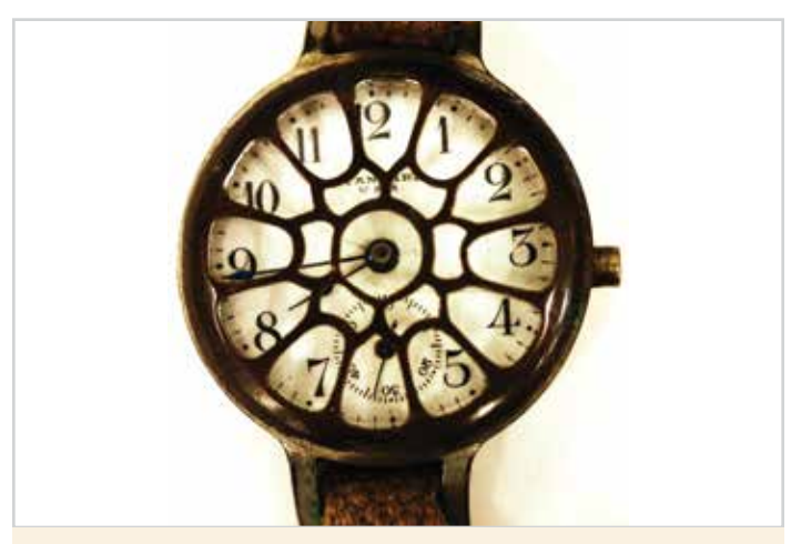
Trench watch.

For lessons, lectures, and other ideas, visit <a href="http://ww.theworldwar.org">http://ww.theworldwar.org</a>.