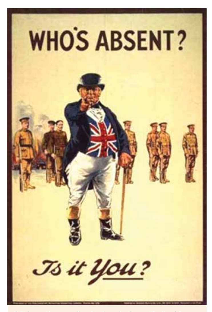
British recruiting poster featuring the national personification, John Bull.

evidence, but also received wisdom, these are exactly the kind of learners we need to be producing, to ensure that the leaders and politicians of the early twenty-first century do not repeat the mistakes made by those in the early twentieth century.