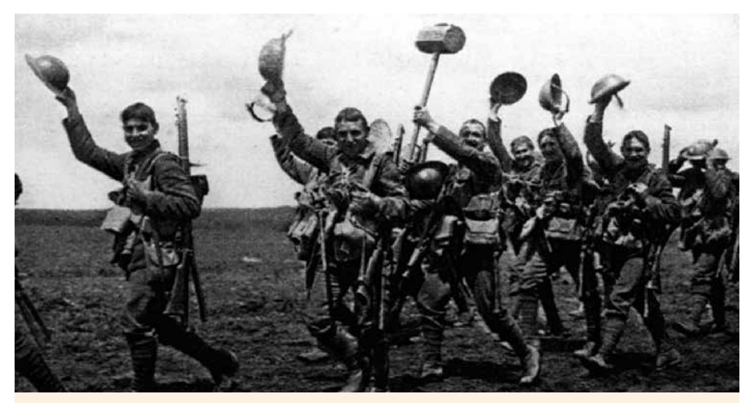
When first issued to units of the Expeditionary Force, steel helmets were seen as "trench stores" – items that, like flare pistols and wire cutters, were only used by trench garrisons. By the end of 1916, however, the helmet had become an item of personal issue, a part of the uniform that accompanied a soldier everywhere he went. Read more: http://www.histomil.com/viewtopic.php?f=3&t=492&start=90#ixzz32Hee1NYM (www.histomil.com).