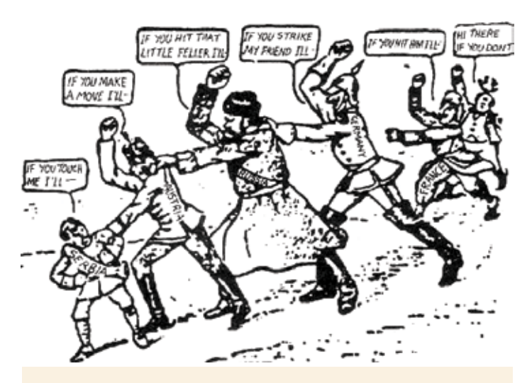
Cartoon from the Brooklyn Eagle , published in July 1914, illustrating the chain of alliances in Europe. (Image courtesy of the BBC)

window into the chain of cause and effect that drives history forward.