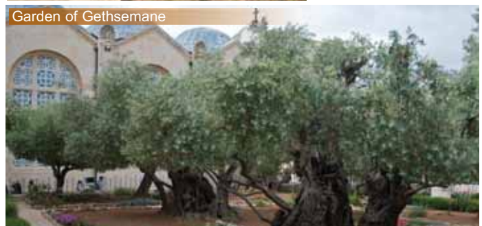
Garden of Gethsemane