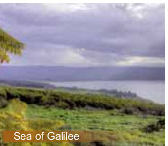
Sea of Galilee