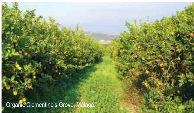
Organic Clementine's Grove, Málaga.

We have been importing Padron Peppers from Galicia as far as we can remember, and four years ago we started to import Calçots, the famous leek shaped green onion from Catalunya that even has its own festival. Then we found that several of our customer's were struggling to find consistently good avocados and tomatoes. At that point we looked into organic vegetables production and began working directly with growers from the tropical growing areas in Andalucía and other parts of the Mediterranean Coast, where the long hours of sunshine create an ideal growing environment for many fruit and vegetables.