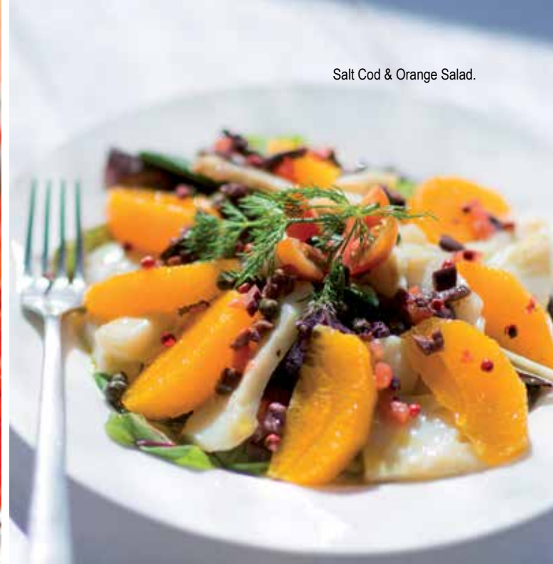
Salt Cod & Orange Salad.