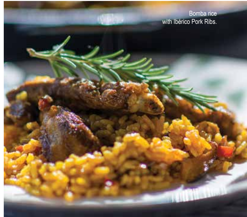
Bomba rice with Ibérico Pork Ribs.

Short-grained with a pearl-white colour and a uniform consistency. Absorbs three times its volume in water without bursting, which means it absorbs more flavour. It holds its structure well after cooking. Not sticky and always loose textured.