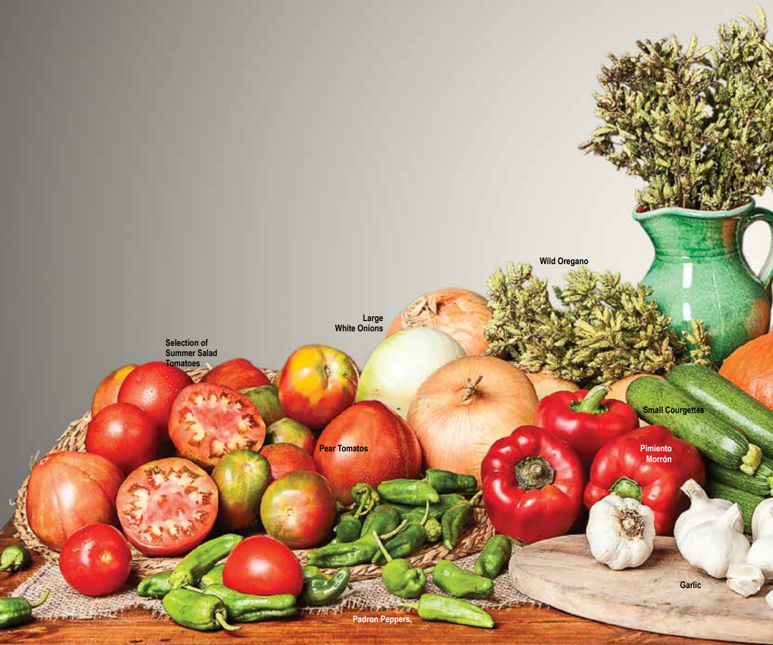
Selection of Summer Salad Tomatoes