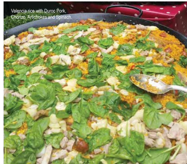
Valencia rice with Duroc Pork, Chorizo, Artichokes and Spinach.