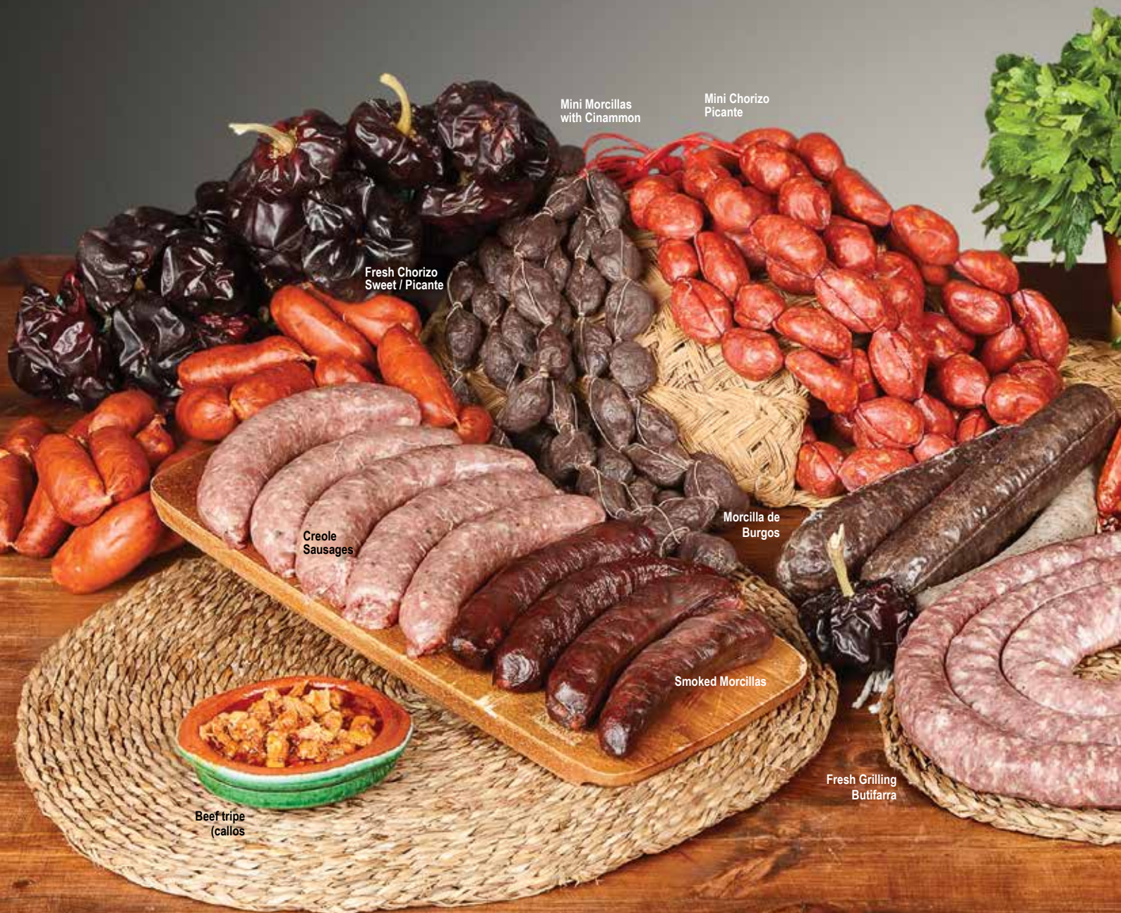
Mini Morcillas with Cinammon