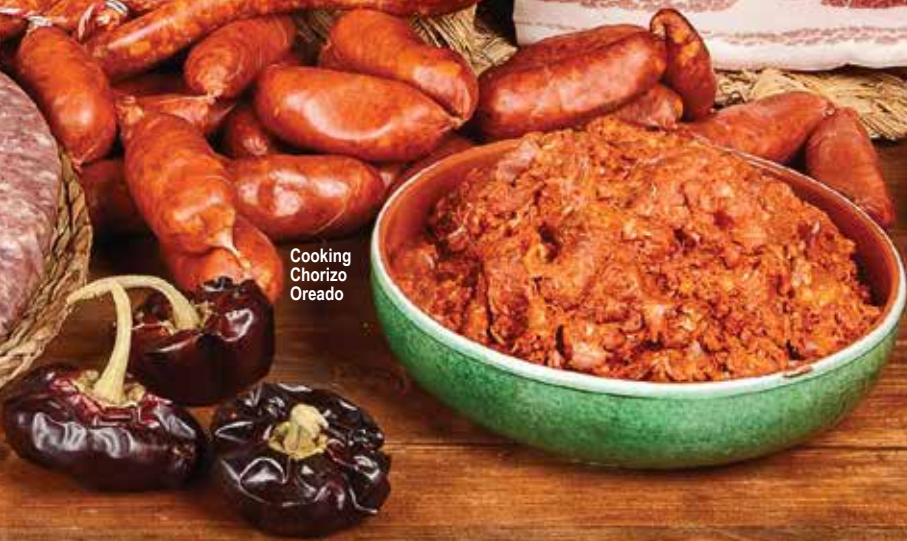
Chorizo Without casing 20% Beef