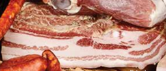
Natural Cured Panceta