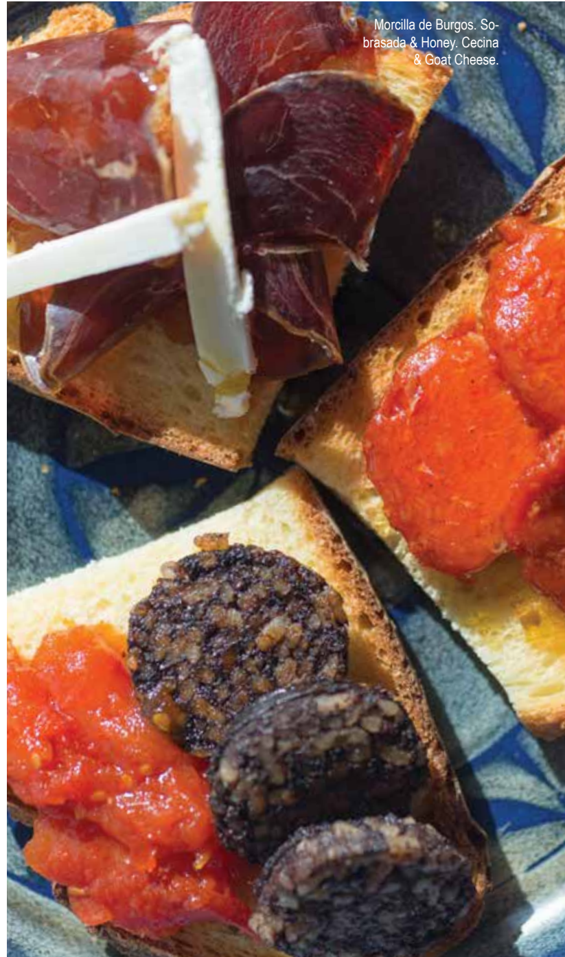
Morcilla de Burgos. So- brasada & Honey, Cecina & Goat Cheese.

This Andalusian black pudding from acorn fed pigs has a longer cure time and is firm. It can be sliced thinly and eaten as part of a cured meat platter, or its amazing flavour can be used to enrich any dish.