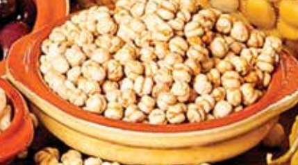
Fried Yellow Chick Peas