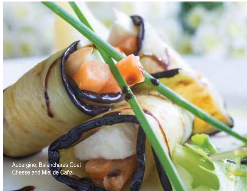
Aubergine, Balanchares Goat Cheese and Miel de Caña.

IT'S 100% NATURAL IT'S THE PURE EXTRACT OF THE SUGARCANE.