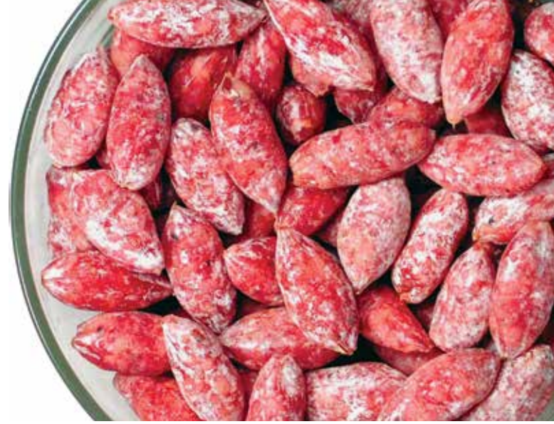
Llaminets bite size salchichón.

(*) They are bite size artisanal chorizo and salchichón that can be served with some bread sticks as a great bar snack, with virtually no preparation needed. Great aperitif.