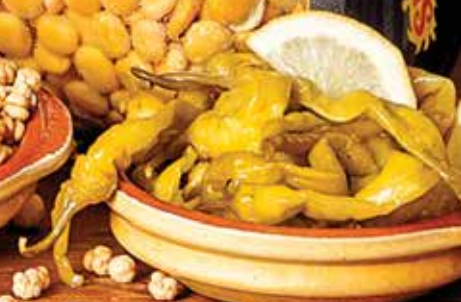
Sweet pickle Guindillas in Olive Oil