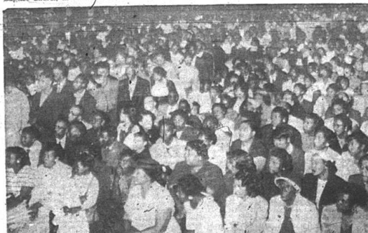
APPROXIMATELY 4,000 PERSONS jammed the Hughes-Quinn Auditorium in East St. Louis to attend the mass meeting protesting the Mississippi lynch-murder of 14-year-old Chicagoan Emmett Louis Till. The victim's mother was a principal speaker at the rally. Stands were made use of every available foot of space in the auditorium.