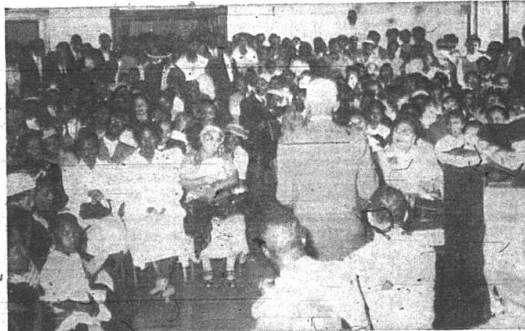
THE MASS MEETING PROTESTING the Emmett Till lynching was held at Friendship Baptist Church in Madison. Several hundred persons crowded into the small church to attend the rally.