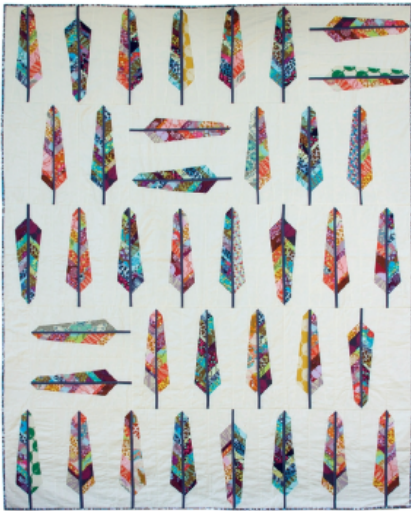
feather bed quilt by anna maria horner

Fees: $15 for AQG members, $20 for non members