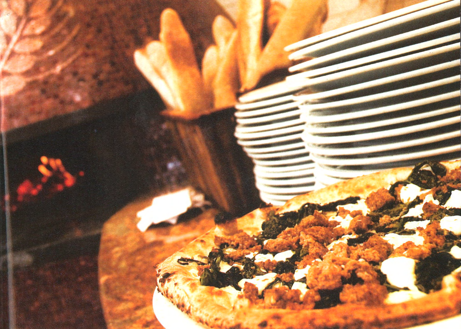
Above: Spacca Napoli's signature pizza waits to be sliced. Below: Goldsmith proudly poses with a pie and a Menabrea beer.

L onathan Goldsmith spins around, big-eyed. "Want to watch me make dough?" We are in the bowels of Goldsmith's year-old pride and joy, Spacca Napoli Pizzeria, which sits on a bustle-free corner shared by a commuter rail line in Chicago's fast-growing Ravenswood neighborhood.