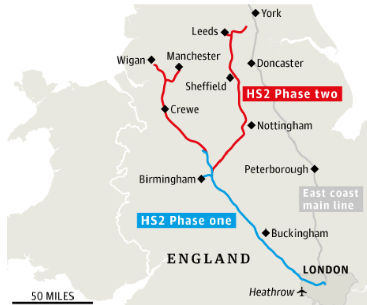
Figure 2 The route of HS2

Design as analysis: examining the use of precedents in parliamentary debate.