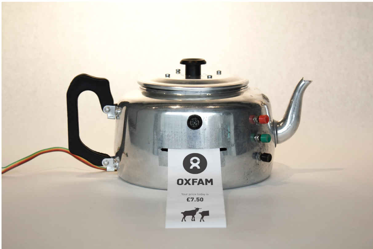
Figure 1 The Hagggle-O-Tron was developed using a combination of design from data methods including video ethnography and participant observation through the use of a technology probe.

The variety of methods for gathering data is not limited to the four examples above but extends to all processes in which data is gathered 'from' settings before being analysed and used to inform subsequent design decisions. Through the multi-disciplinary Equator project, a good deal was established about the appropriate ways that data can be gathered and used to inform design. Hemmings et al. list seven steps toward design: 1. Planning; 2. Recruiting Participants; 3. Selecting Volunteers; 4. Assembling Domestic Probes; 5. Deploying Domestic Probes; 6. Retrieving and Analysing Probes, before 7. Speculative Design (2002). This order of data capture ultimately ends in the studio, where the designer can learn and design 'from' the materials.