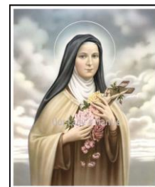
St. Therese of Lisieux

FEB. 5, MONDAY: DEPART WASHINGTON/DULLES OR NEW YORK/JFK FOR PARIS ON AIR FRANCE.