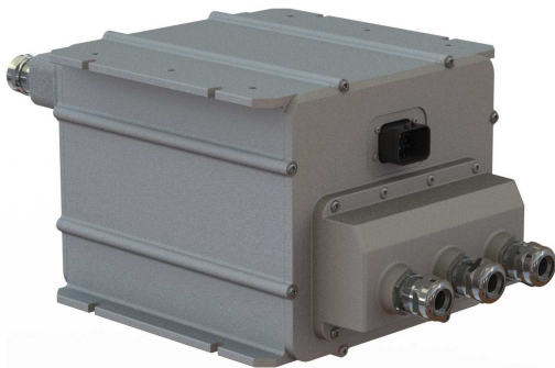
Drive Control Unit (DCU)