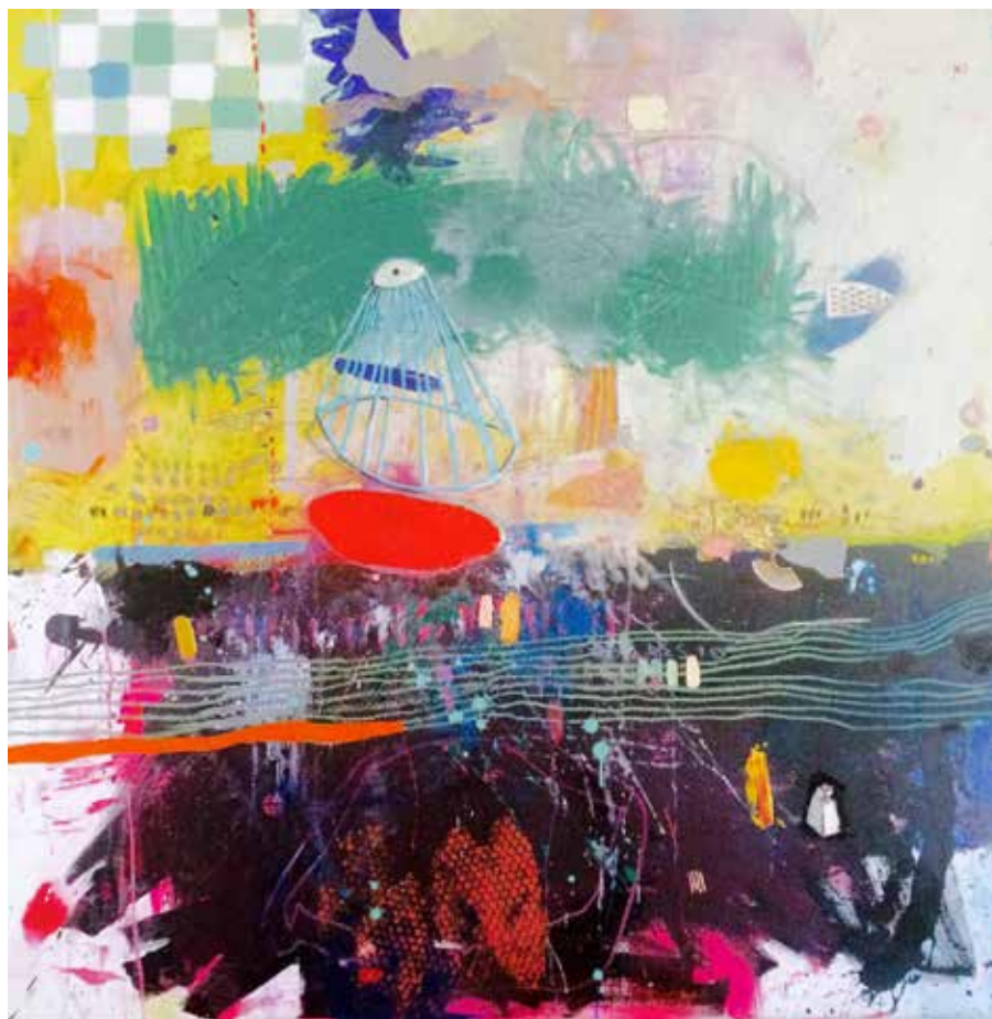
Uncontainable 2020 Mixed media on Belgian linen 140cm x 140cm R 47 000-00