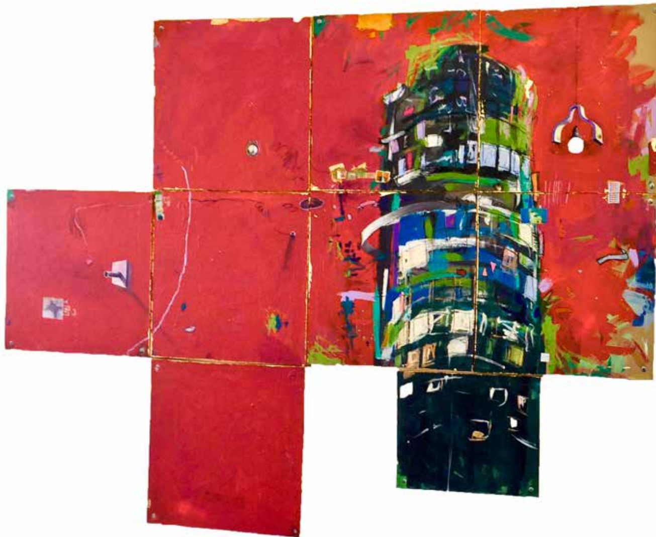
Ponte City Puzzle 2019 Mixed media on canvas (9 panels) 180cm x 240cm R 78 000-00