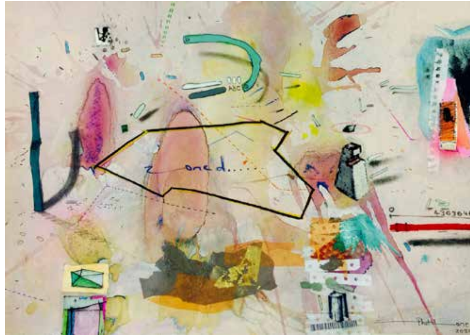
Zoned 2020 Mixed media on paper 42cm x 58cm (framed) R 8 500-00