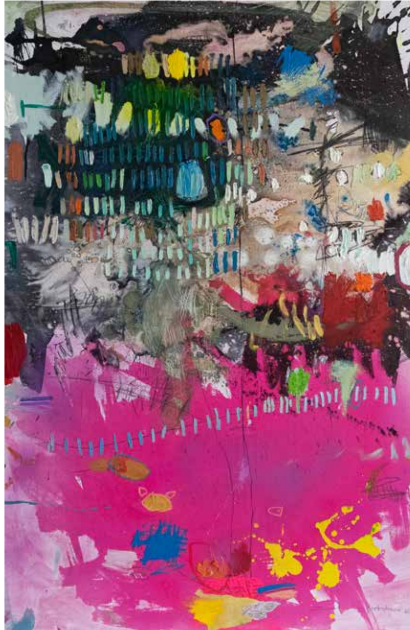
Scientific Power - Butterfly series 2019 Mixed media on Belgian linen 120cm x 80cm R 38 000-00