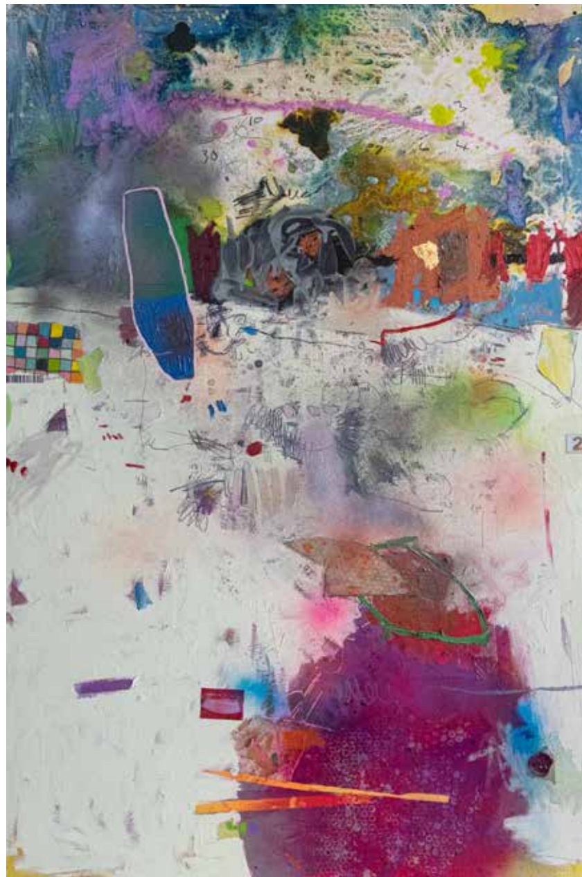
Blue Cocoon - Butterfly series 2019 Mixed media on Belgian linen 120cm x 80cm R 38 000-00