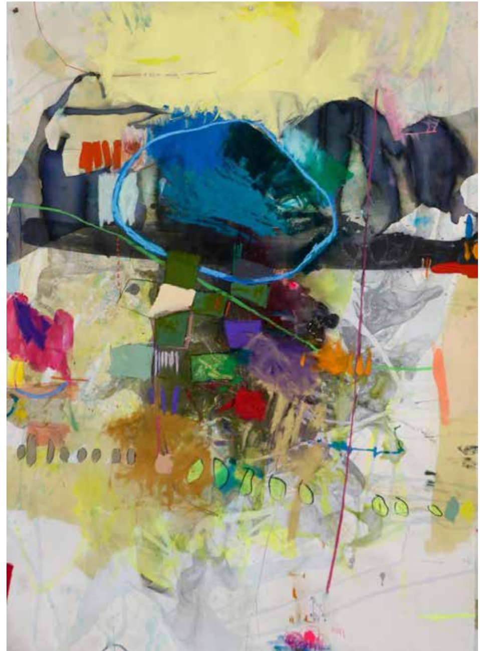
Magical Cocoon - Butterfly series 2019 Mixed media on Arches paper (300g) 175cm x 125cm (framed) R 50 000-00