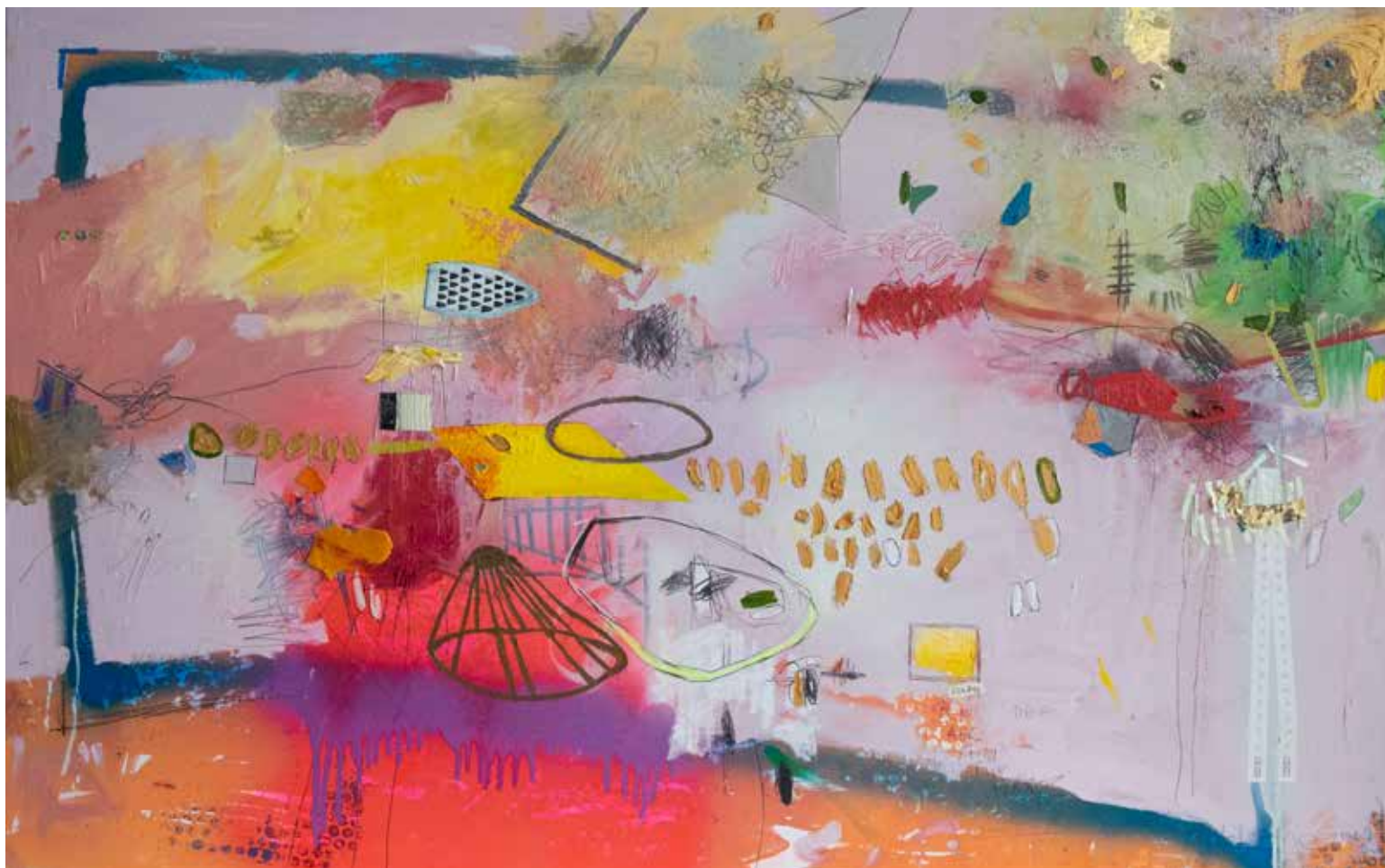
Power in Process - Butterfly series 2019 Mixed media on Belgian linen 80cm x 120cm R38 000-00