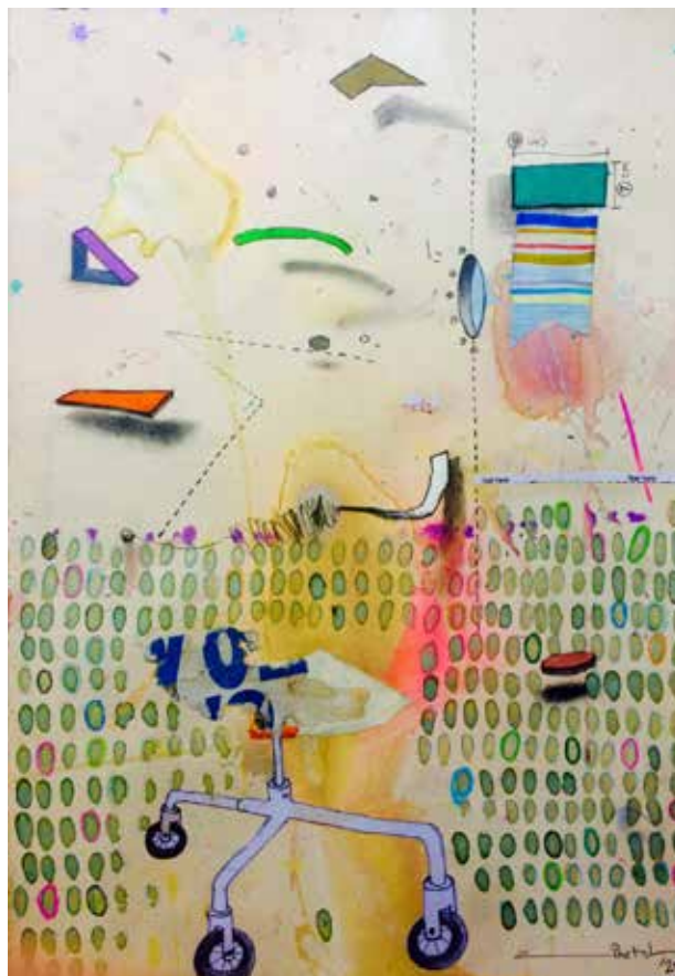
Transformed - Butterfly series 2020 Mixed media on paper 50cm x 35cm (framed) R 7 500-00