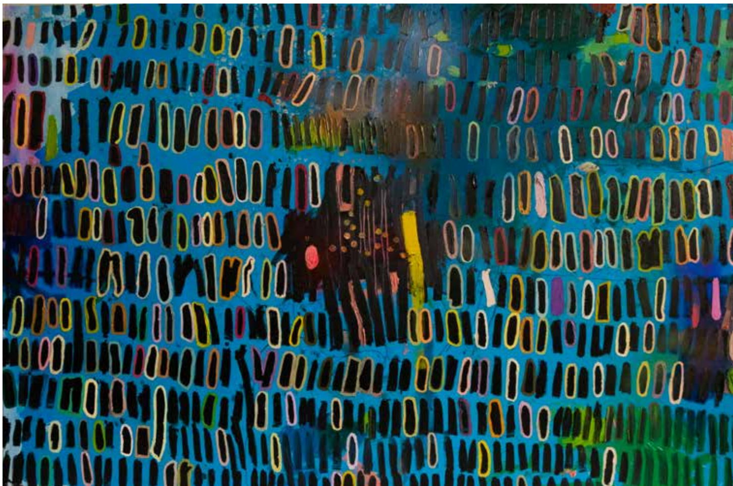
Power in Process - Butterfly series 2019 Mixed media on Belgian linen 80cm x 120cm R38 000-00