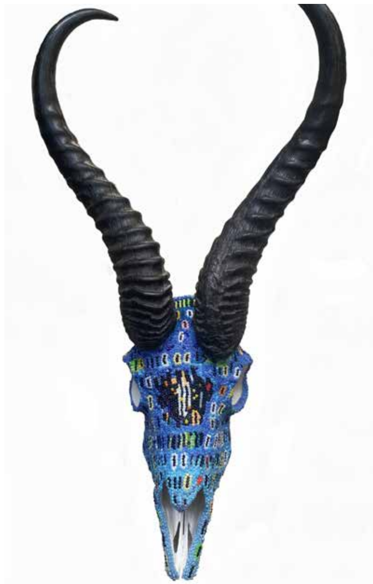
Springbok 2020 Beads and glue 46 cm (chin to top of horns) x 25 cm (between horns) x 18 cm (front to back) R9 600-00