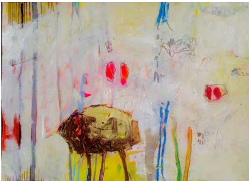
On The Rock 2020 Mixed media on paper 38.5cm x 53cm (framed) R 7 500-00