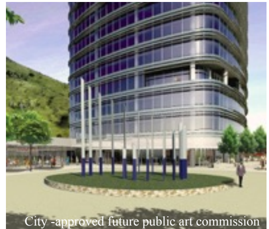
City -approved future public art commission