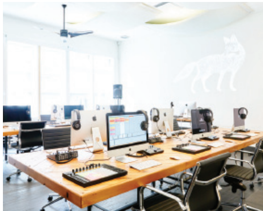
A look at the newly opened DJ school, The Foxgrove, located at 43 W. 29th St.