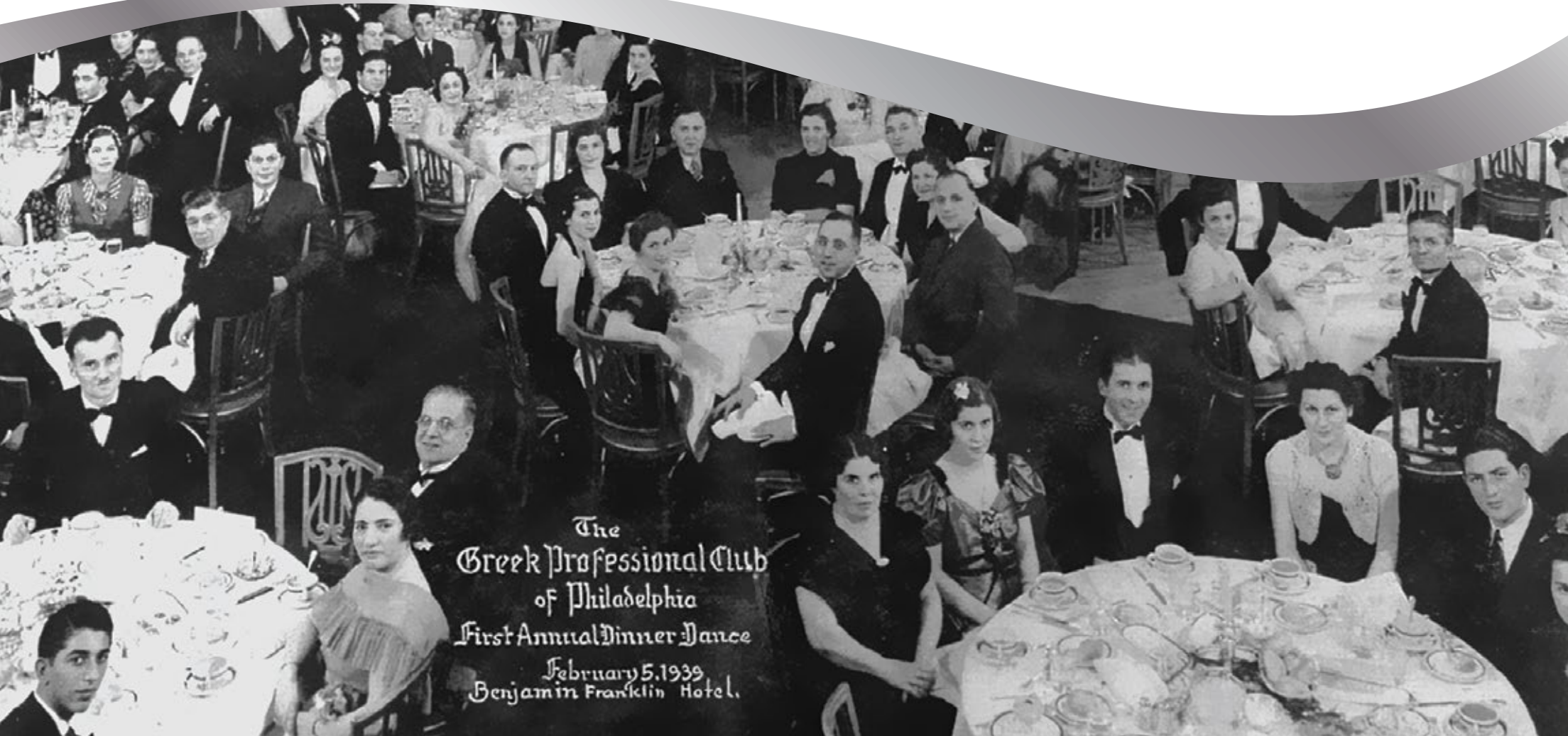
The Greek Professional Club of Philadelphia First Annual Dinner Dance February 5, 1939 Benjamin Franklin Hotel.

Such goodness, therefore, is rare, praiseworthy and noble.