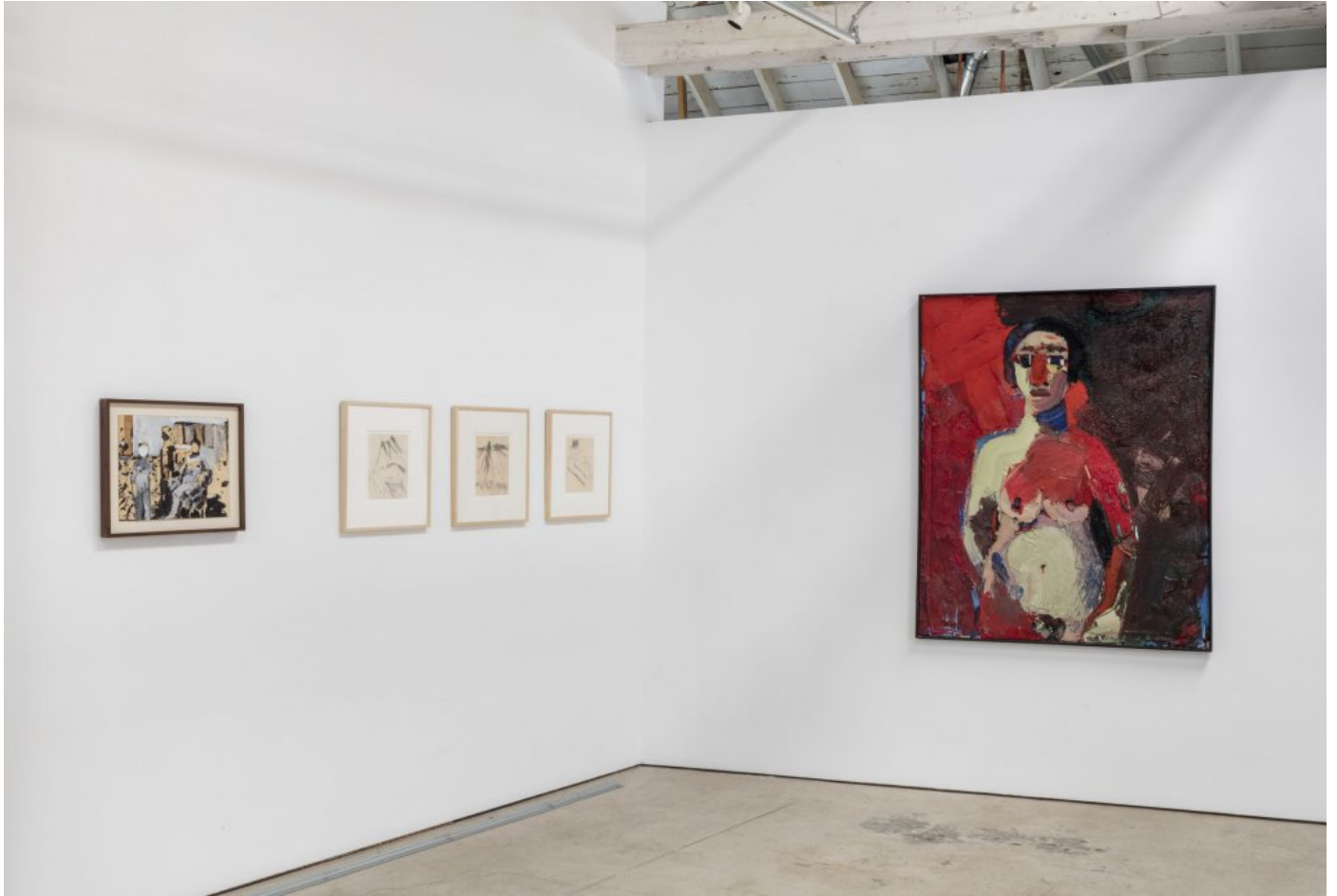
Installation view (works by Joan Brown), The Rat Bastard Protective Association at the Landing, Los Angeles, 2016.