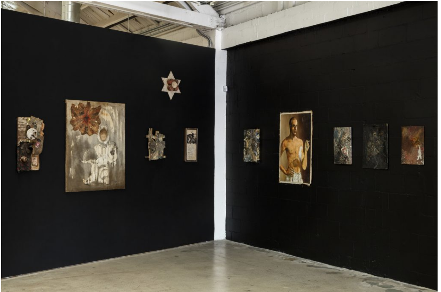
Installation view, The Rat Bastard Protective Association at the Landing, Los Angeles, 2016.