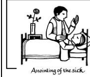
Anointing of the sick.