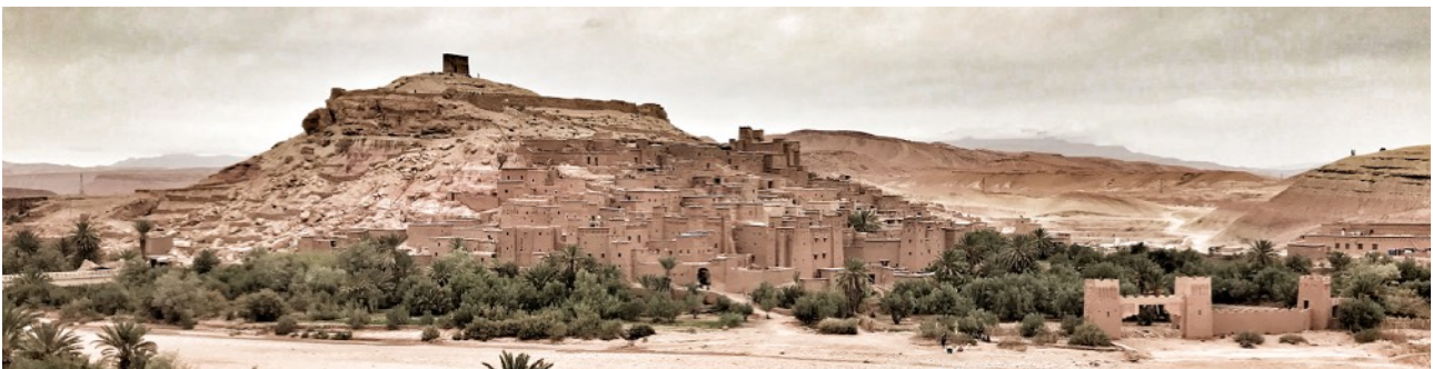
PHOTO: Ait Ben Haddou Ksar, UNESCO World Heritage Site

Accommodation on HB includes breakfast and dinner.