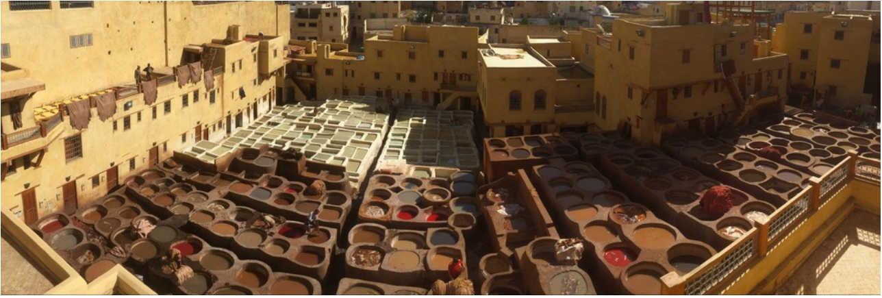
PHOTO: Fes leather tannery