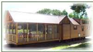
Arrowhead Cove Series