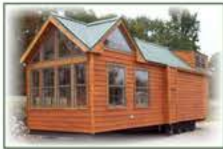
Big Bear Series