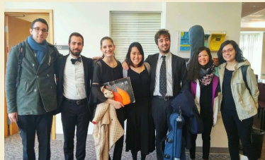
New Italian friends!

and seven patriotic Italian and US pieces that were specially arranged and conducted by Simone Tonin.